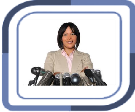
give a speech